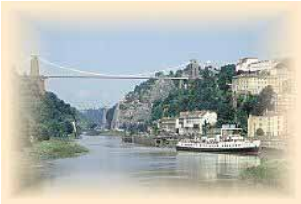
Clifton Suspension Bridge