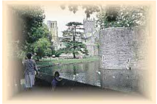
Wells Bishops Palace

To plan your stay here, you might consider visiting: